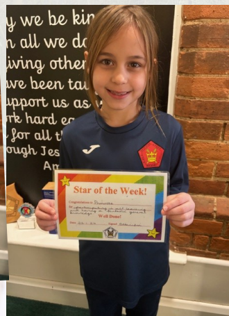
Primrose - Year 3